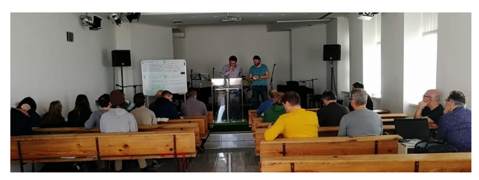
Langham in Slovenia

As you know, we live in strange times. The year began normally and at the very beginning of January I was still at the "Revive" student conference in Germany, which was attended by several thousand students and where I spoke at a "Langham" workshop on preaching. In the last week of January, I traveled to Wales, UK; where I spoke at several evangelistic events. Also, throughout January, I led several brothers from our local church through weekly personal evangelism training. In February, after the Langham Preaching Seminar, Level 2, in Slovenia, I traveled to the Netherlands and Belgium where I gave evangelistic speeches at 3 universities. At the end of the month we had a meeting of the "My Brothers keeper" board at which we planned the June conference. We were happy that our wives joined us this time.