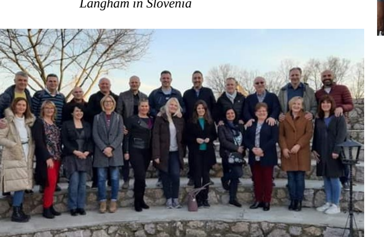
"My Brothers Keeper" board with wives