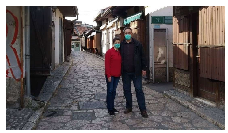
empty streets of Sarajevo