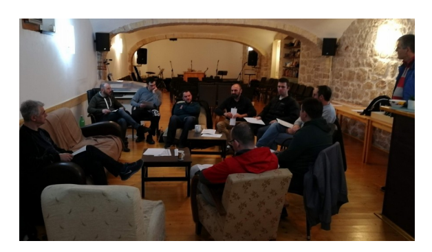
Langham in Šibenik, CRO

March also started normally, in the first week of March I spoke at the Langham Preaching Seminar, Level 3, in Šibenik, Croatia. In mid-March, I was supposed to speak at evangelistic events in the Czech Republic, then in Slovenia and at a meeting of the Protestant Evangelical Alliance in Belgrade, Serbia, but unfortunately all those planned events as well as those planned in the coming months were canceled due to the Covid-19 virus. Quite strict anti-virus measures were introduced in Bosnia & Herzegovina, which included curfew, ban on gatherings, closing of borders... We had to cancel all meetings in the church and all my planned trips were postponed.