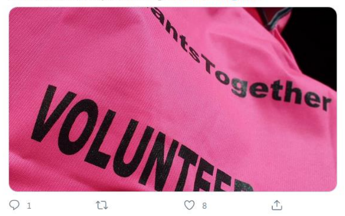
Figure 2 Hi vis volunteer vest

Don't forget, we would love to see pictures of you wearing your hi-vis jackets and helping those in need. Please always ask for permission before posting pictures of others.