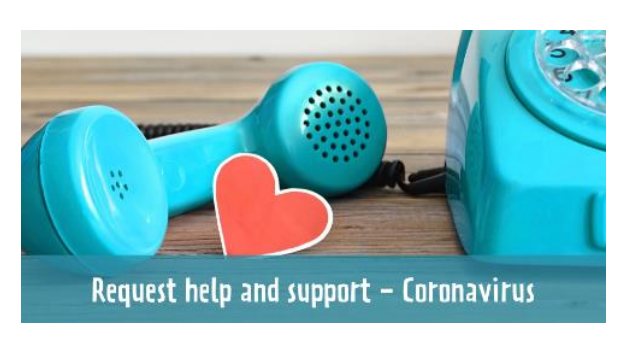
Figure 1 Telephone helpline

We continue to receive calls from members of the public who need help, so please promote the number where you can to anyone who needs assistance and help to support Northamptonshire's vulnerable residents. As a reminder, the dedicated support line is: